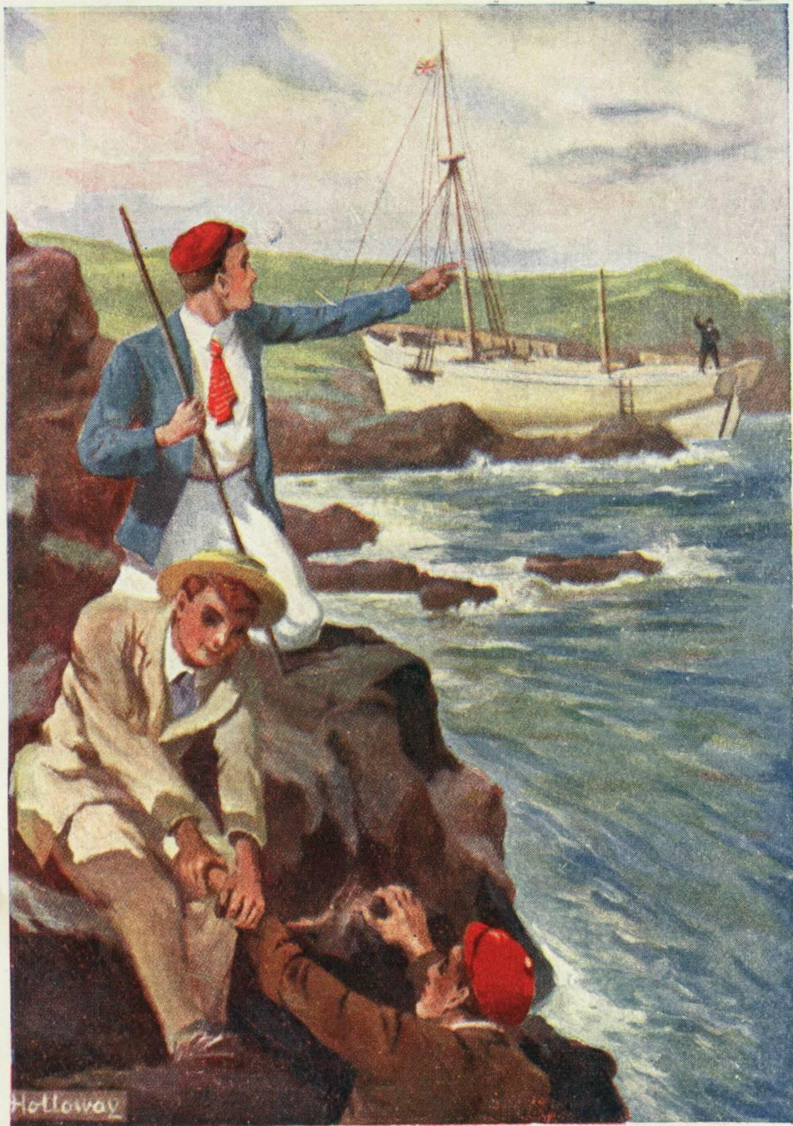
The wreck—a curious mongrel, half ship, half house (page 41).