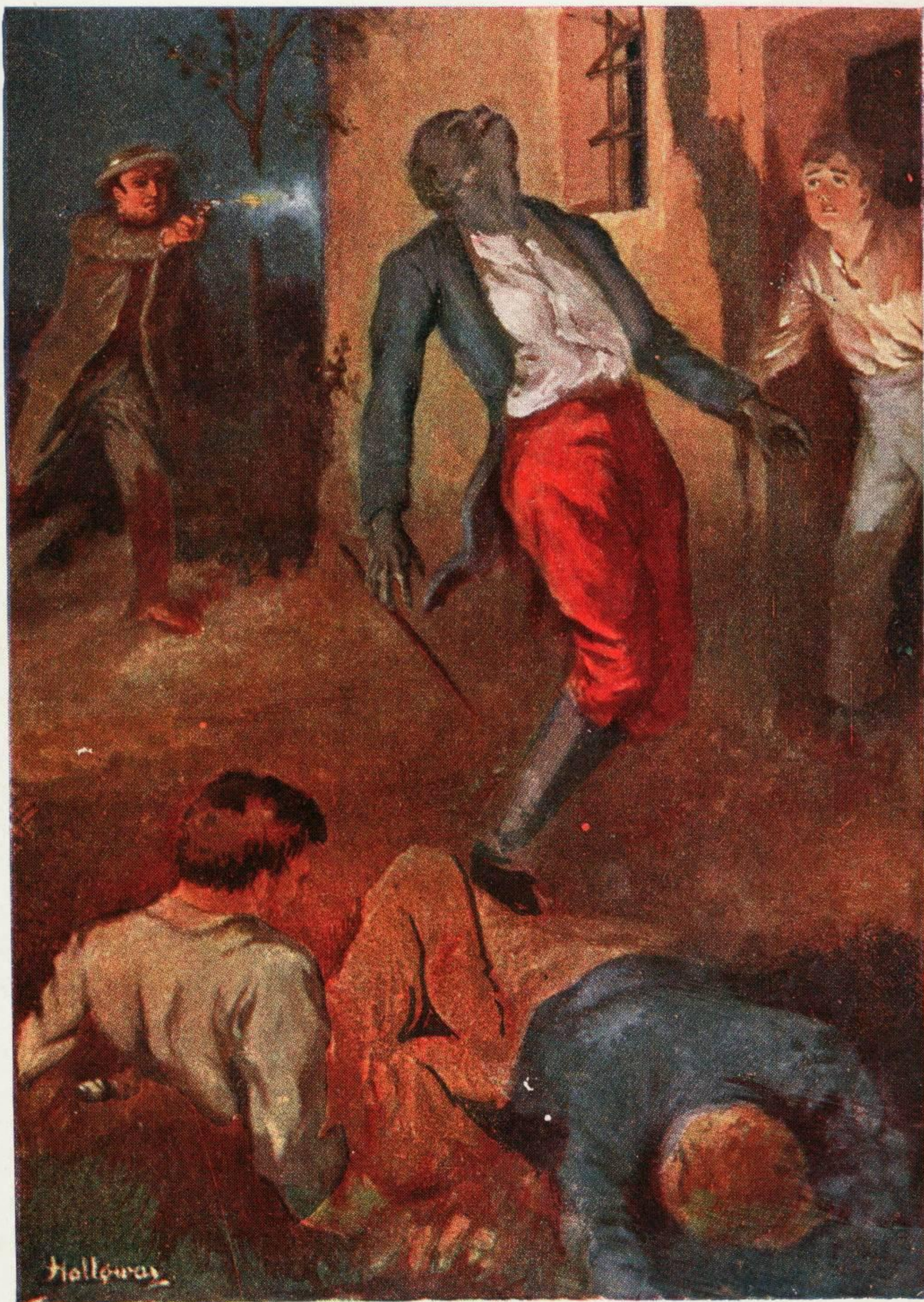
The fight with the smugglers (page 363).