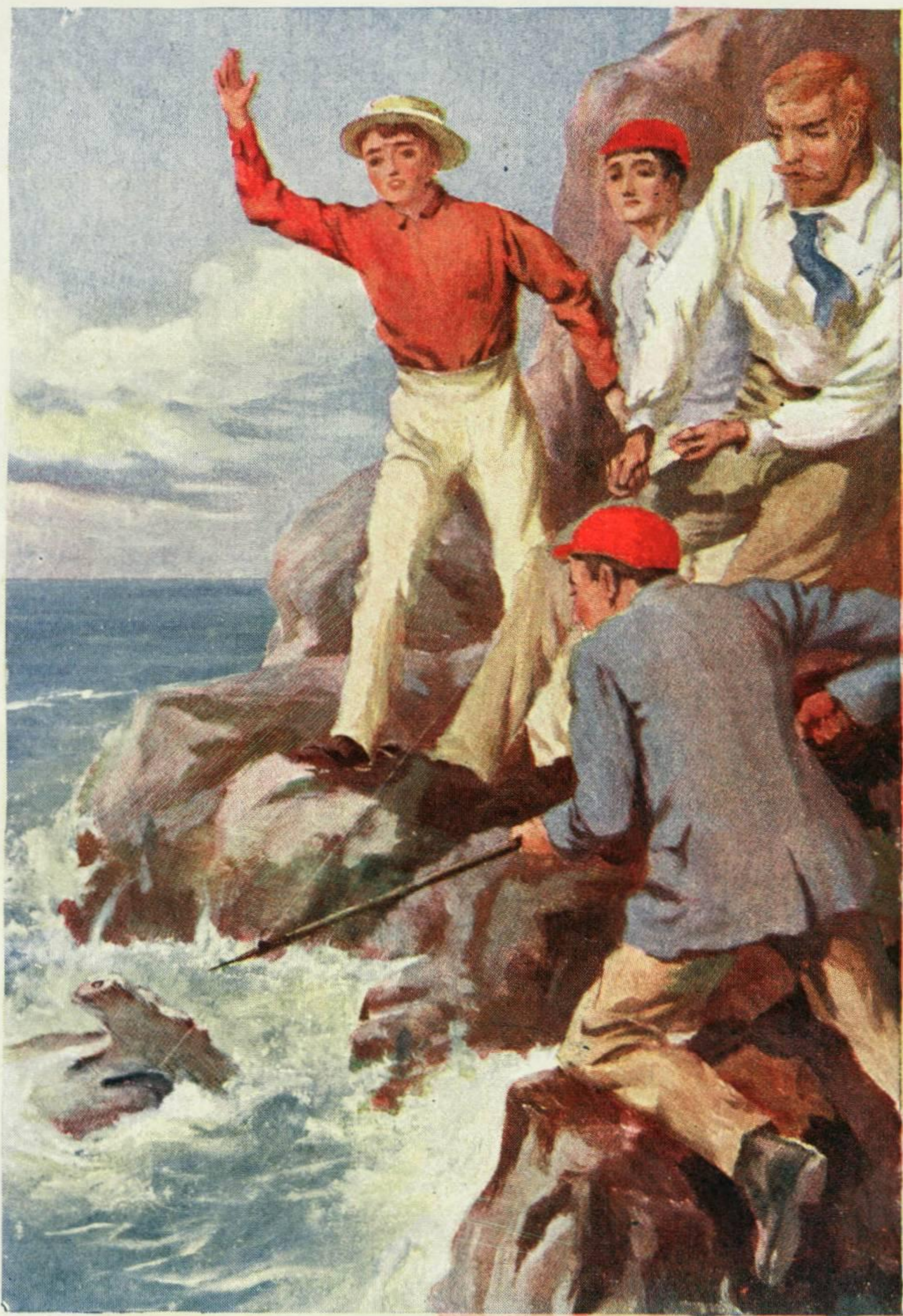
Catching the shark (page 130).